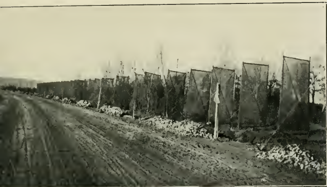
BURLAP SCREENS TO HIDE THE ROAD FROM THE GERMANS